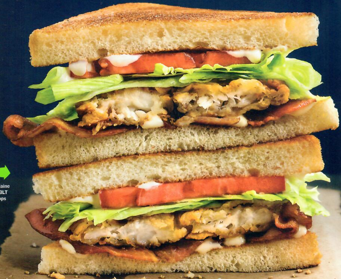
➔ Crispy Maine Lobster BLT from Chops

FROM BANH MI TO BLT, WHERE TO FIND YOUR FAVES